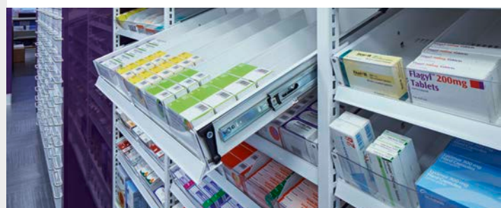
3 FAMA Sloping Trays Stock is picked from the front: trays only need to be pulled out for replenishment. New packages are placed at the back, making stock rotation easy (first-in, first-out principle).