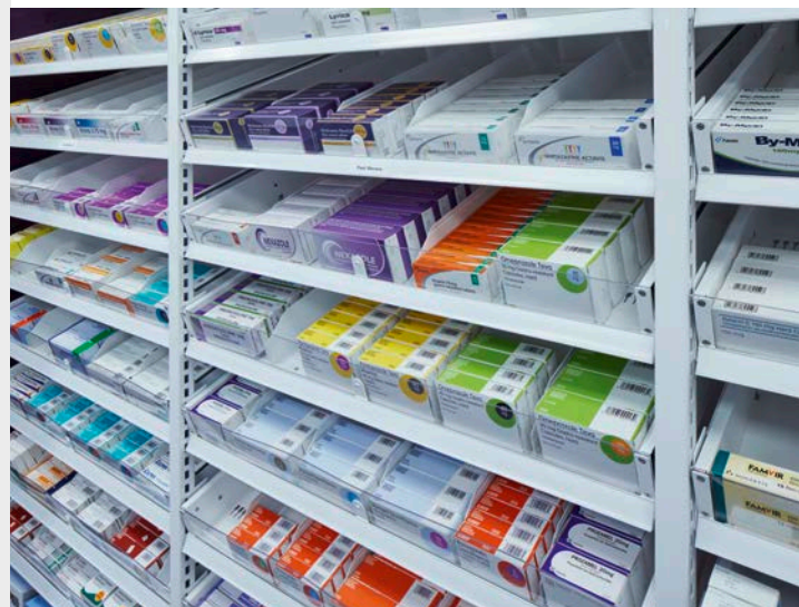
2 FAMA Shelving System 500 Fast-moving items and open split packs are stored in sloping shelves close to the scripts-out counter. This reduces walking distances and enables a faster customer service.