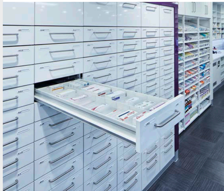
1 FAMA GX drawers Slow-moving items, large and heavy packages as well as bottles are stored in FAMA large-capacity drawers close to the scripts-out counter.